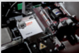
In-line card transport system