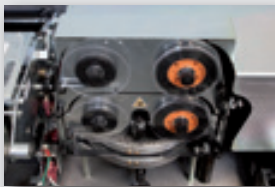
Embossing and indent