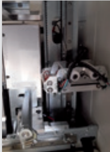
Vertical card transport system